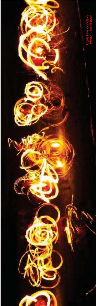
Utah Fire Conclave